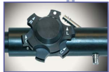
VSF8x135 Control surfaces are easy to reach and use.