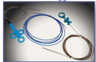
Quality accessories expand the capability of the instrument, improving your productivity while shortening your procedure times.