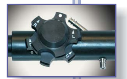
VSF8Ix135 Control surfaces are easy to reach and use.

*4-way lengths up to 10' available upon request.